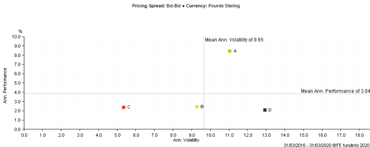
Scatter Chart Reflecting Volatility and Annualised Return 4 years in GBP (launched March 2016)