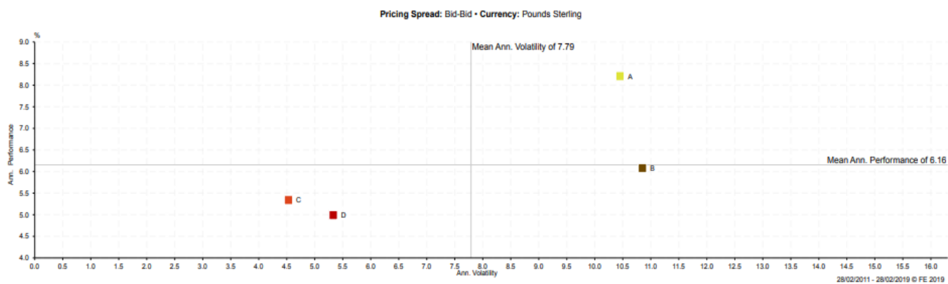
Scatter Chart Reflecting Volatility and Annualised Return in GBP over the past 8 years